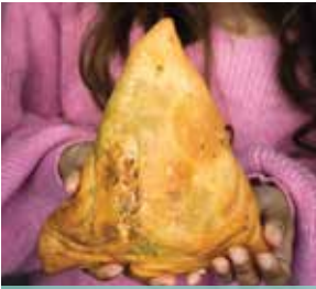
@ Giant Samosa