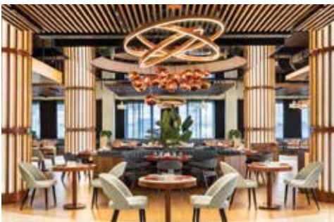
Wyndham Bukhara Restaurant