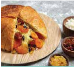
@ Bread & Plov