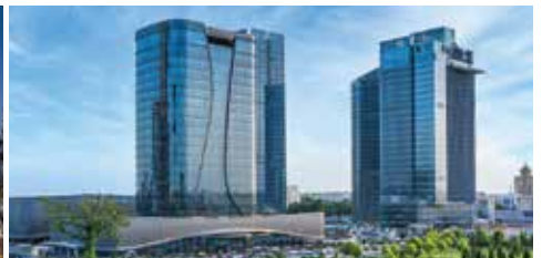
(Tashkent) Hilton Honors