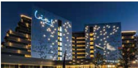
Lia! by Minyoun Stars of Ulugbek