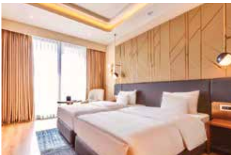
Lia! by Minyoun Stars of Ulugbek Room