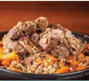
@ Lamb Tandoor Meat